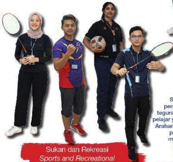
Sukan dan Rekreasi Sports and Recreational

Semua staf universiti termasuk staf akademik, pentadbiran, perpustakaan, dan keselamatan adalah diberi kuasa memberi teguran sama ada secara lisan atau bertulis kepada mana-mana pelajar yang didapati melanggar mana-mana peruntukan di dalam Arahan Pentadbiran ini. Mana-mana pelajar yang tidak mematuhi peruntukan Arahan Pentadbiran ini boleh dihalang daripada memasuki atau berurusan di kawasan yang dikuatkuasakan peruntukan Arahan Pentadbiran ini atau apa-apa tindakan pentadbiran lain yang ditetapkan dari semasa ke semasa.