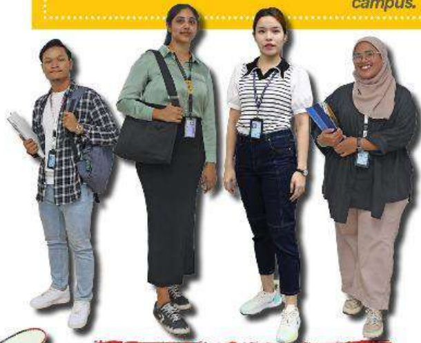
Kuliah, Urusan Pejabat, Peperiksaan dan Perpustakaan Lectures, Office Matters, Examination and Library

Semua pelajar dikehendaki mematuhi Arahan Pentadbiran Universiti Malaysia (Etika Berpakaian dan Penampilan Pelajar) 2024 sewaktu berada di kawasan kampus. UM Students must adhere to the Universiti Malaya Administrative Directions (Student Dress Code and Appearance) 2024 while on campus.