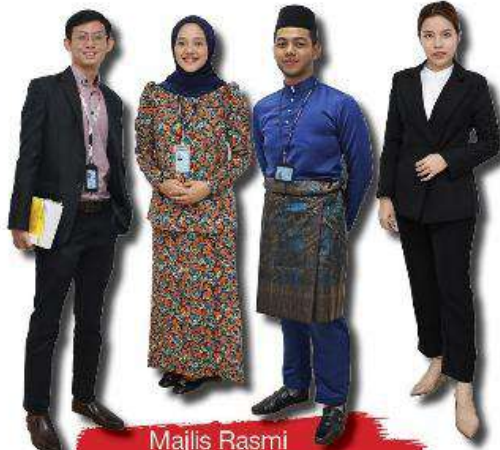
Majlis Rasmi Official Events

Semua pelajar dikehendaki mematuhi Arahan Pentadbiran Universiti Malaysia (Etika Berpakaian dan Penampilan Pelajar) 2024 sewaktu berada di kawasan kampus. UM Students must adhere to the Universiti Malaya Administrative Directions (Student Dress Code and Appearance) 2024 while on campus.